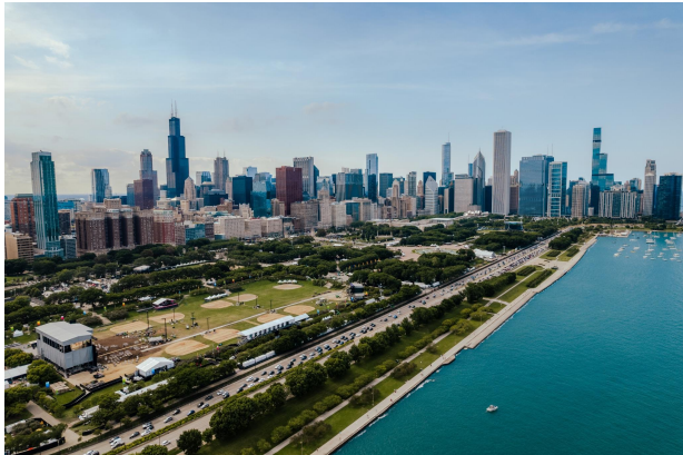
Fall Diocesan League Directors Meeting